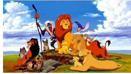
the Lion King